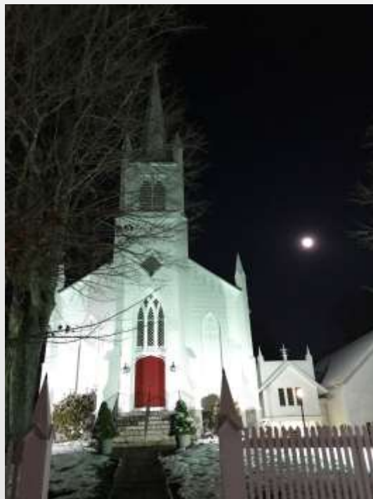
Christ Church on a cold winter's night.